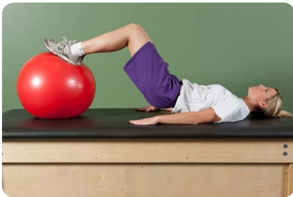
Physioball hamstring exercises – hip lift, bent knee hip lift, curls, balance