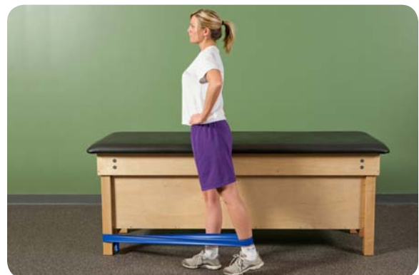
Standing theraband/pulley weight – Extension