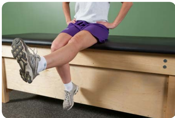
Seated knee extensions