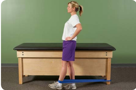
Theraband resistance on affected side – Flexion (start very low resistance) ONLY IF TOLERATED