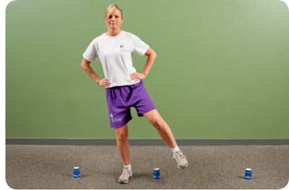
Lateral walking over cups and hurdles (pause on affected limb), add ball toss while walking