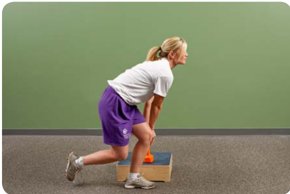
Single leg pick-ups, add soft surface