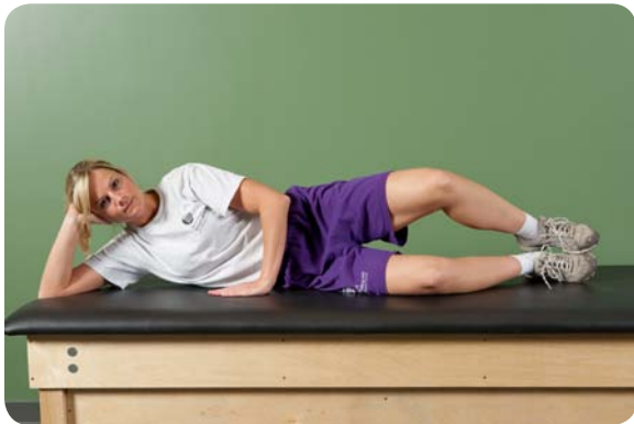
Clamshells (pain-free range)