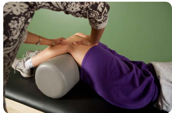
Stiffness dominant hip mobilization – grades III, IV