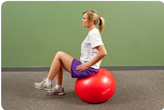
Seated physioball progression – hip flexion