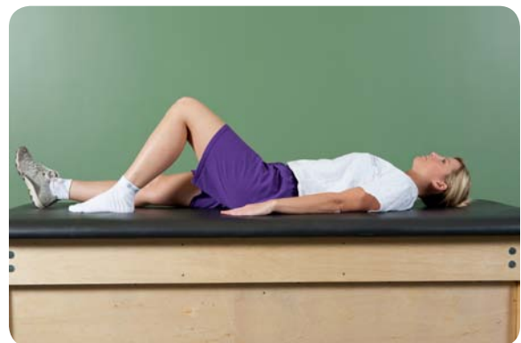
Heel slides, active-assisted range of motion