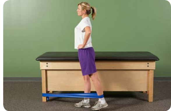
Theraband resistance on affected side – Extension (start very low resistance)