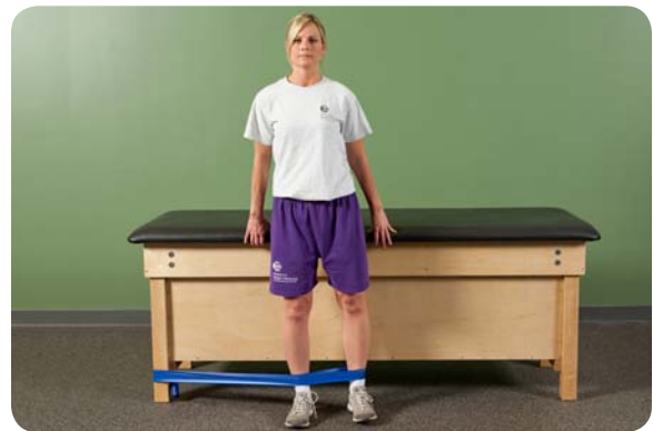
Theraband resistance on affected side – Abduction (start very low resistance)