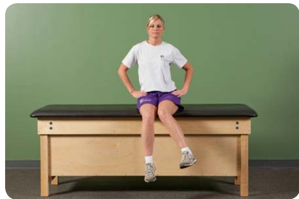
Seated weight shifts