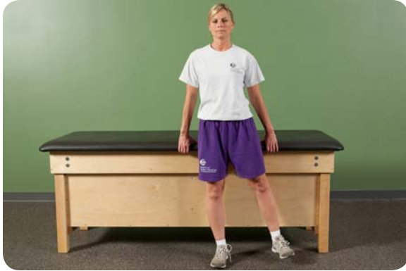
Standing abduction without resistance