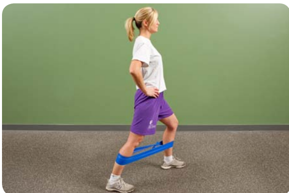
Theraband walking patterns – forward, sidestepping, carioca, monster steps, backward, ½ circles forward/backward – 25 yds. Start band at knee height and progress to ankle height