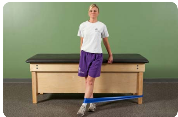
Theraband resistance on affected side – Adduction (start very low resistance)