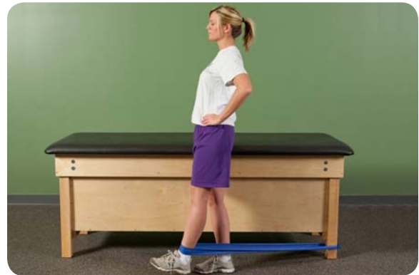
Standing theraband/pulley weight – Flexion