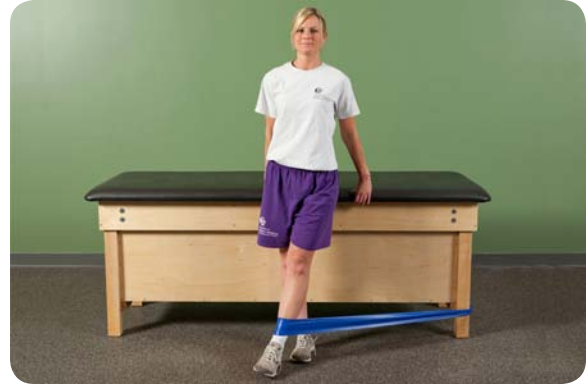
Standing theraband/pulley weight – Adduction