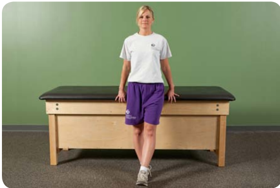
Standing adduction without resistance