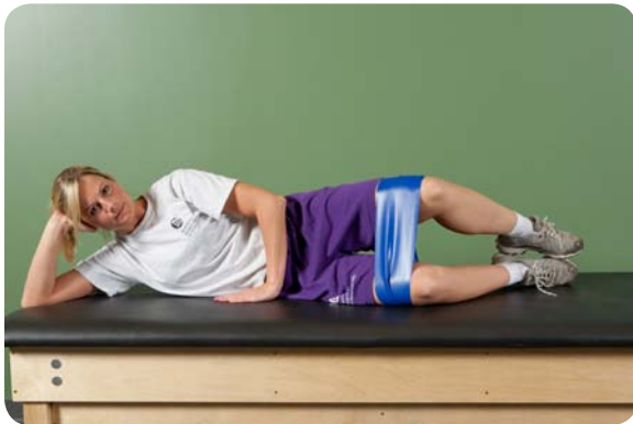
Clamshells with theraband