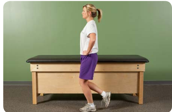
Single leg body weight squats, increase external resistance, stand on soft surface