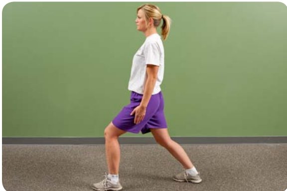
Lunges progress from single plane to tri-planar, add medicine balls for resistance and rotation