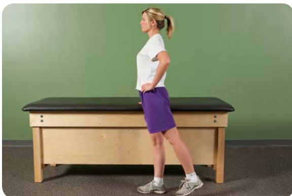
Standing extension without resistance