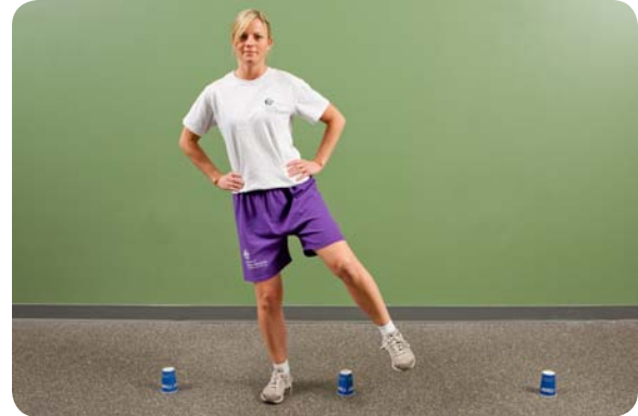
Side steps over cups/hurdles (with ball toss and external sports cord resistance), increase speed