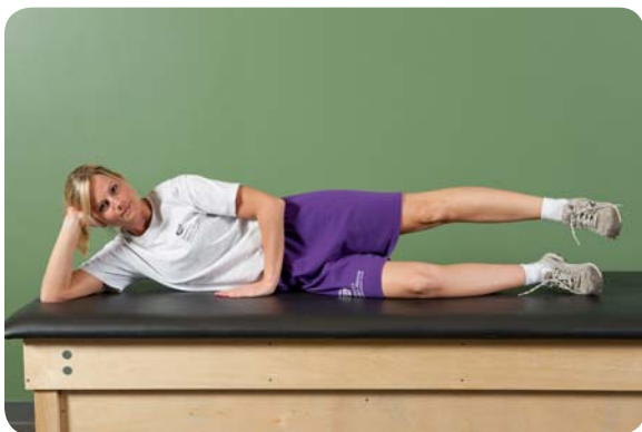
Leg raise – Abduction