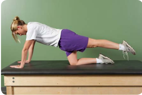
Quadruped 4 point support, progress 3 point support, progress 2 point