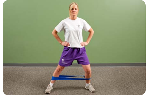
Sidestepping with resistance (pause on affected limb), sports cord walking forward and backward (pause on affected limb)