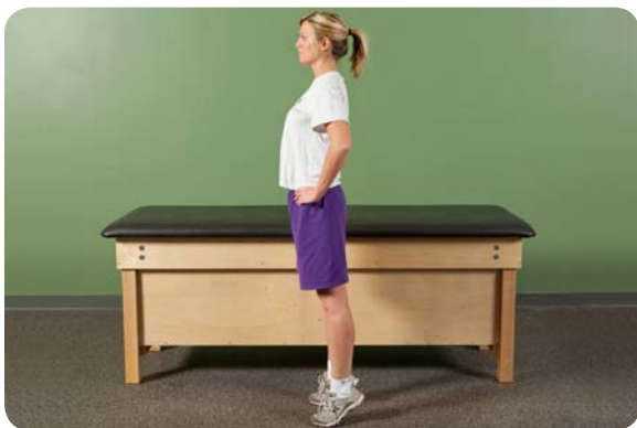
Standing heel lifts