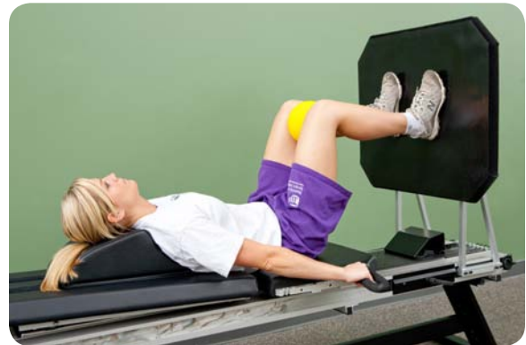
Shuttle leg press 90 degree hip flexion with co-contraction of adductors