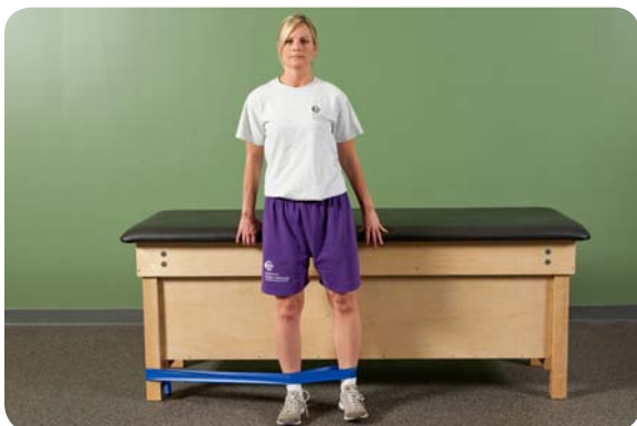
Standing theraband/pulley weight – Abduction