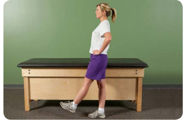
Standing flexion without resistance