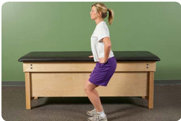
1/4 Mini squats