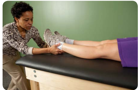
Pain dominant hip mobilization – grades I, II