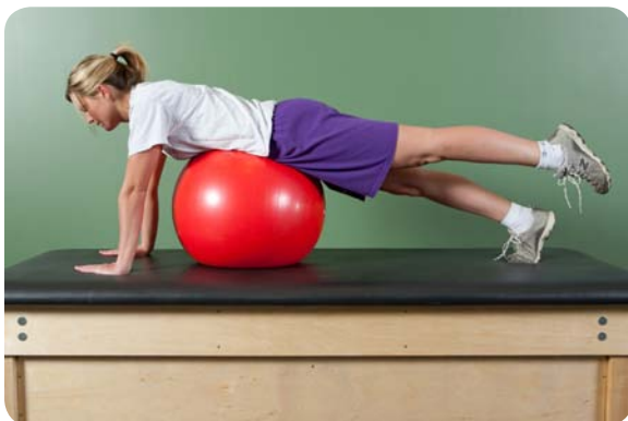
Superman on physioball – 2 point on physioball